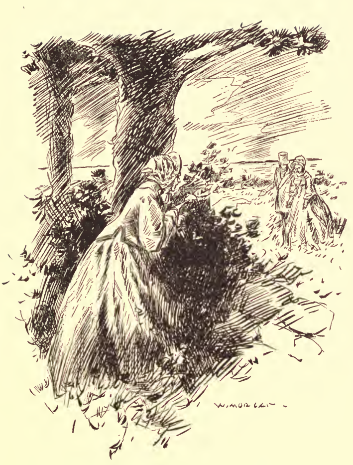
"Rising to peer over the bushes at the minister and Grace."